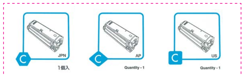
The pictures on the right are the illustrations found on cyan toners intended for sale in the Asian Pacific market, the American market and the Japanese market.

Indications that you might be purchasing a counterfeit product could consist of one or more of the following: